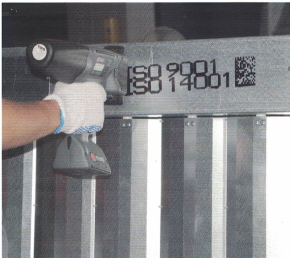
Prints on steel with black universal ink

EBS Ink-Jet revolutionized hand-held coding when we introduced the HandJet EBS-250. Now our next-generation HandJet EBS-260 model provides reimagined features and functionality for even more innovative, portable coding.