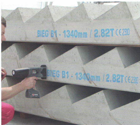
Also prints on concrete with blue pigmented ink