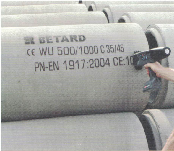
Prints on concrete with special UV-resistant black ink