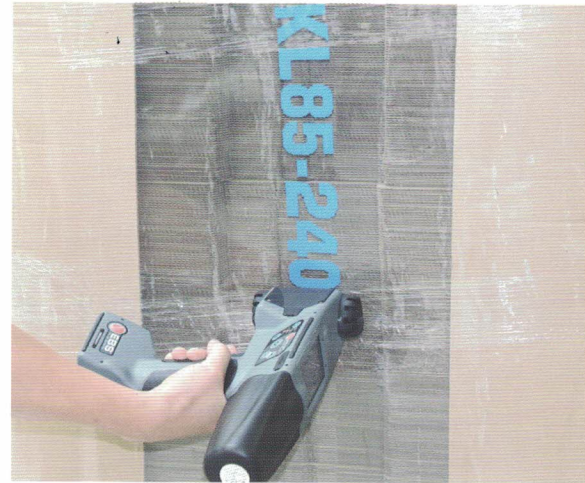
Prints on stretch wrap with pigmented ink

See a demo on our YouTube channel: www.youtube.com/ebsinkjetsystems .