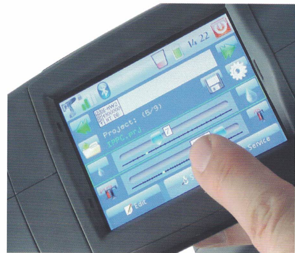
Control and input via touchscreen